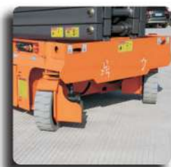
Compact Turning Radius